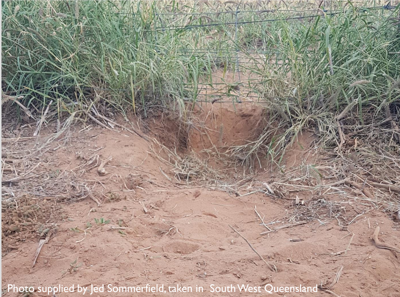
taken in South West Queensland

Dogs will still try to dig and climb in.