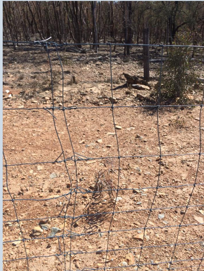
Tying the rolls together