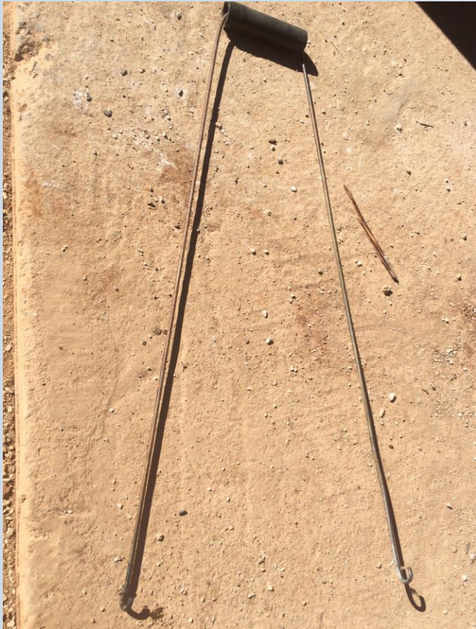
Pulling in the apron